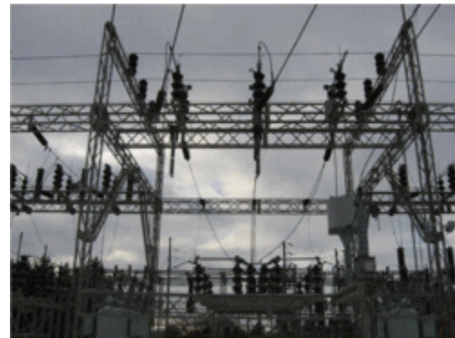
Transmission Substation with B-PLC

The motivations for modernizing the pilot wire protection schemes with broadband powerline carrier are improving the reliability and accuracy of line protection and reducing maintenance costs associated with pilot wire. Past pilot wire replacement often required a fiber path between stations, which had a high installation cost and required line outages to install, in most cases. The use of fiber was required to support the latest digital protection, control and monitoring schemes, such as line current differential protection and phasor measurements. But testing has shown that the new Amperion technology can also support these protection schemes, so costly fiber is not required. According to initial estimates, the capital cost of B-PLC could be as low as one tenth the cost of fiber optic communications. Another advantage of B-PLC compared to fiber is its simple and fast installation process, accelerating the implementation of substation retrofit projects.